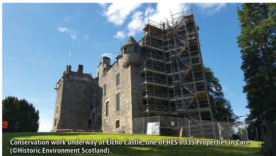
Conservation work underway at Elcho Castle, one of HES's 335 Properties in Care.

We decided that this screening approach was sufficient for our needs in our current risk assessment process, and it was more beneficial to focus further effort on the investigation of specific properties. At the property-level we will be able to include a wider range of climate impacts, more detailed information about the property, and the knowledge and expertise of those involved with site management.