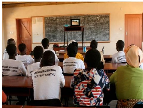
A video being shown in kasache

Then the film was screened straight from a 13" laptop computer placed on a higher level so all the villagers could see well. There were small speakers plugged to the computer, powered by AA batteries, to increase the volume of the audio. The moment the computer was turned on and the audience saw villagers like them delivering the lessons the room was filled by a respectful attention.