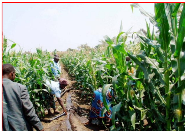
Maize under irrigation in Kasache Village

2. Irrigation farming: Agricultural practices in Mphunga are entirely dependent on rainfall. Yet in the neighboring village of Kasache, simple technology allows for irrigation farming through treadle pumps, providing water to plants and increasing production.