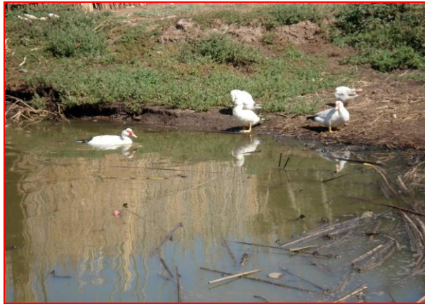
Adoption of duck rearing in Mphunga Village

which after experiencing more frequent flooding decided to substitute chickens with ducks (they are able to float during floods). Now Mphunga exports ducks to neighboring communities.