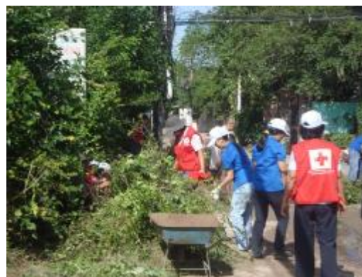
Local actions to prevent dengue fever that implemented by VNRC

With its auxiliary role to the government, the Vietnam Red Cross works in partnership with UN agencies, researching institutes and civil society organizations to contribute to the process of developing and implementing national action plan on climate change adaptation in health.