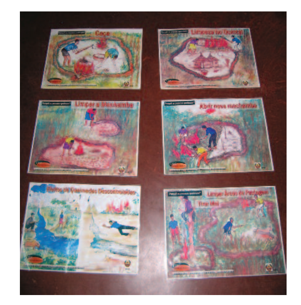
Figure 2: Prevention material produced by MINAG

However, the lack of human resources in the District Agriculture Office (one forestry technician and eight extension workers with diploma-level education) limits the outreach and support program. They rely mostly on "promoters" (who use extension material and training provided by the government but are paid for their service by the local people) to communicate their prevention message (i.e., do not burn grass and use the slashmulching system). The relationship to MICOA was said to be weak despite initiation of the Action Plan for Prevention and Control of Wildfires.