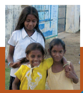
Climate Proofing Vulnerable Coastal Communities