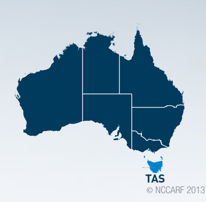
Figure 1: Case study location, state-wide Tasmania

This direct link makes the adaptation task faced by end users much clearer and purposeful, as it does not rely on generalities or averages. The project highlights the specific climate factors that affect end users and makes it easier for them to assess adaptation options once this link is clear. End users reported that with this type of information available to them, the power of a directly relevant approach was immediately obvious.