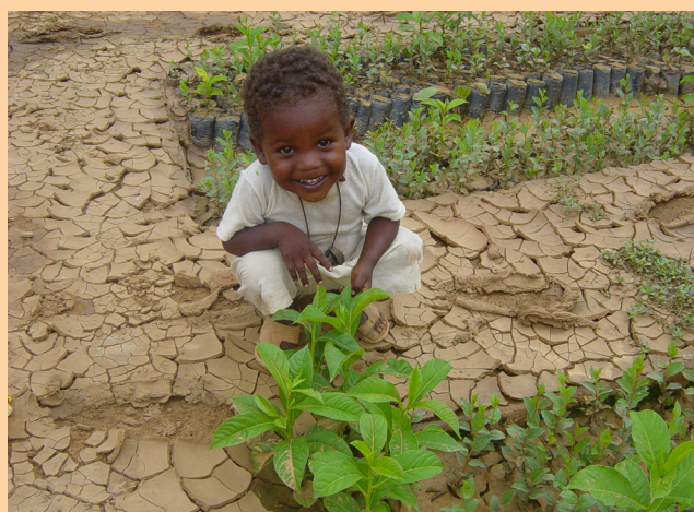
Seedlings for the community forest

Implemented by: Practical Action Funded by: Christian Aid Location: Darfur, Sudan