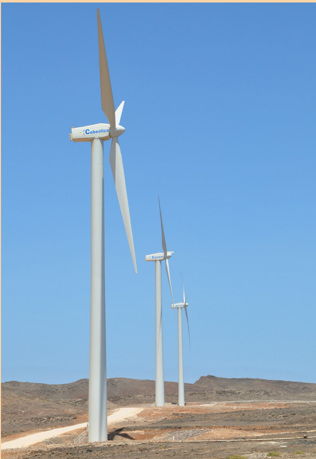
Cabeólica wind turbines

The wind farm was designed so as to minimise alterations to the habitat of Cape Verdean fauna and to protect local wildlife. Preventive and mitigating measures were also implemented to contain waste, soil contamination, visual alteration and further physical disturbances caused by the project. Measures taken to protect birds included locating turbines according to the results of a bird collision assessment and increasing light intensity on the turbines to avoid attracting birds. Transmission lines were buried underground and during the construction period reptiles were collected and relocated.