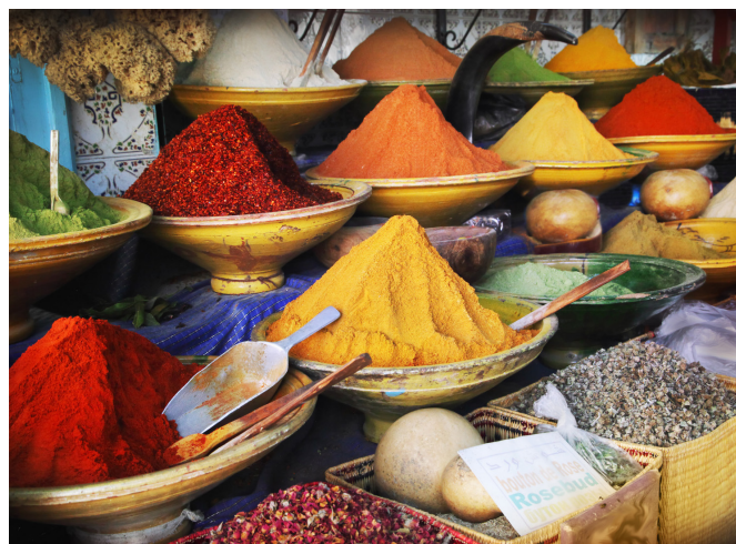
Spice market in Morocco

The AfriCAN Climate portal provides examples of specific practices and projects that aim to have a measurable and verifiable mitigation and/or adaptation impact. This is done by documenting individual projects and initiatives including information about how they were initiated, financed and organised and then assessed against a set of principles.