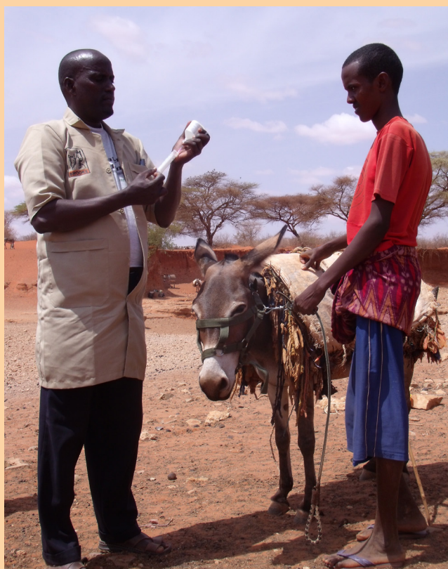
An animal health worker inoculating a donkey in Mandera, Kenya

The first focused on strengthening resilience to drought by improving access to reliable water and thereby mitigating the impacts of water stress in targeted locations. The second sought to reduce vulnerability to drought and mitigate the impacts of climatic shocks for those who depend on livestock for their livelihood.