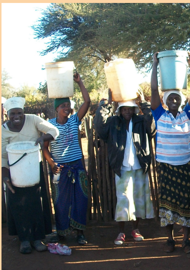
Women walk long distances to collect water from a borehole in Gwanda, Zimbabwe

Disaster committees were established in many villages by the National Institute for Disaster Management (INGC). In the coastal area of Nova Mambone, located in the Inhambane Province of Mozambique, natural resource management committees were established in many villages. Where these were already in place, the project worked with them and provided training on climate change, natural resource management and implementation of the land use plan. The existence of organizations at village level in the Govuro District has been highly advantageous for the project because they have facilitated communication and data gathering.