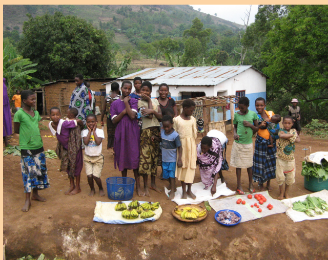
Women in Malawi show the produce from their farms

Community-owned theatrical performances were followed by facilitated dialogues to discover and document community-based solutions to the challenges expressed by women farmers. Policy advocacy training workshops were arranged for women farmers and other community advocates. The community advocates were encouraged to communicate the solutions coming out of these dialogues to decision-makers and service providers.