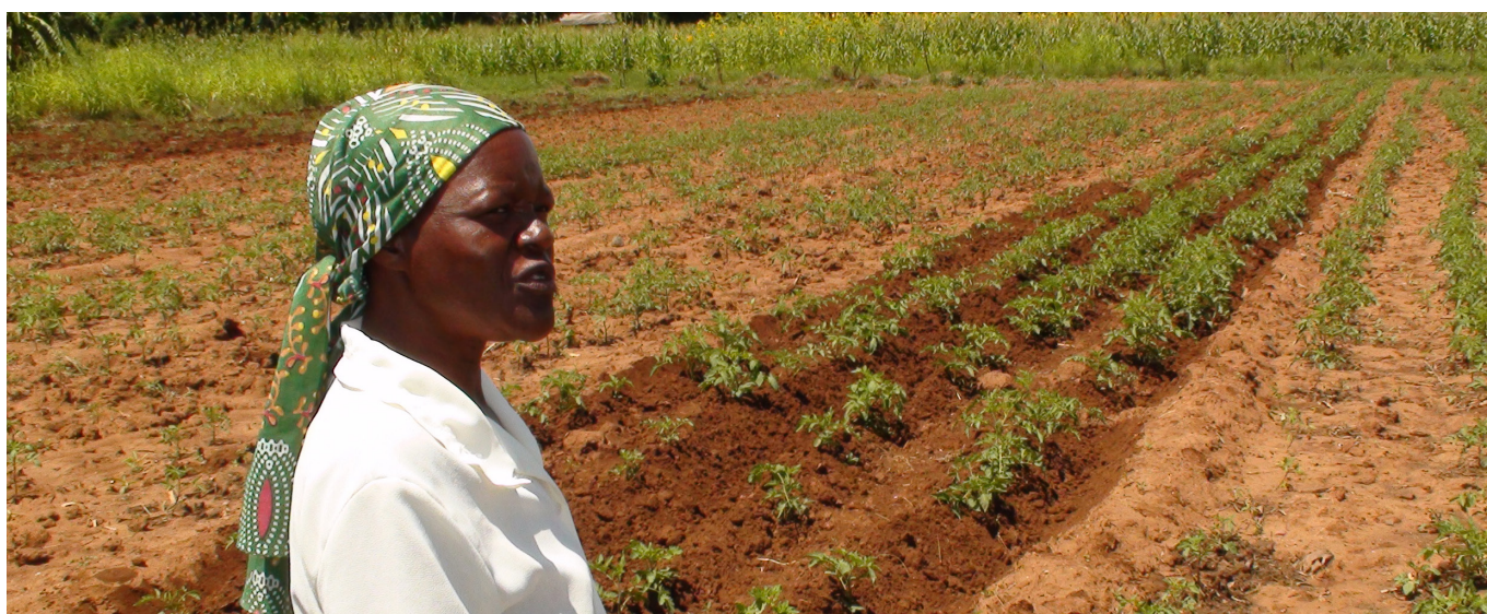
Irrigation scheme in an arid region of Manicaland, Zimbabwe

The eight good practice principles represent critical cross cutting issues shared by the majority of climate change projects, regardless of mitigation/adaptation focus, scope and scale.