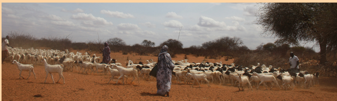
Pastoralists with their livestock in Mandera, Kenya

Today there is a high level of buy-in to Landcare from district council officials in Masaka, Kapchorwa Bukwo and Kween districts in Uganda and Korogwe district in Tanzania. Also, the World Agroforestry Centre in Rwanda is working with various partners to mainstream the Landcare approach.