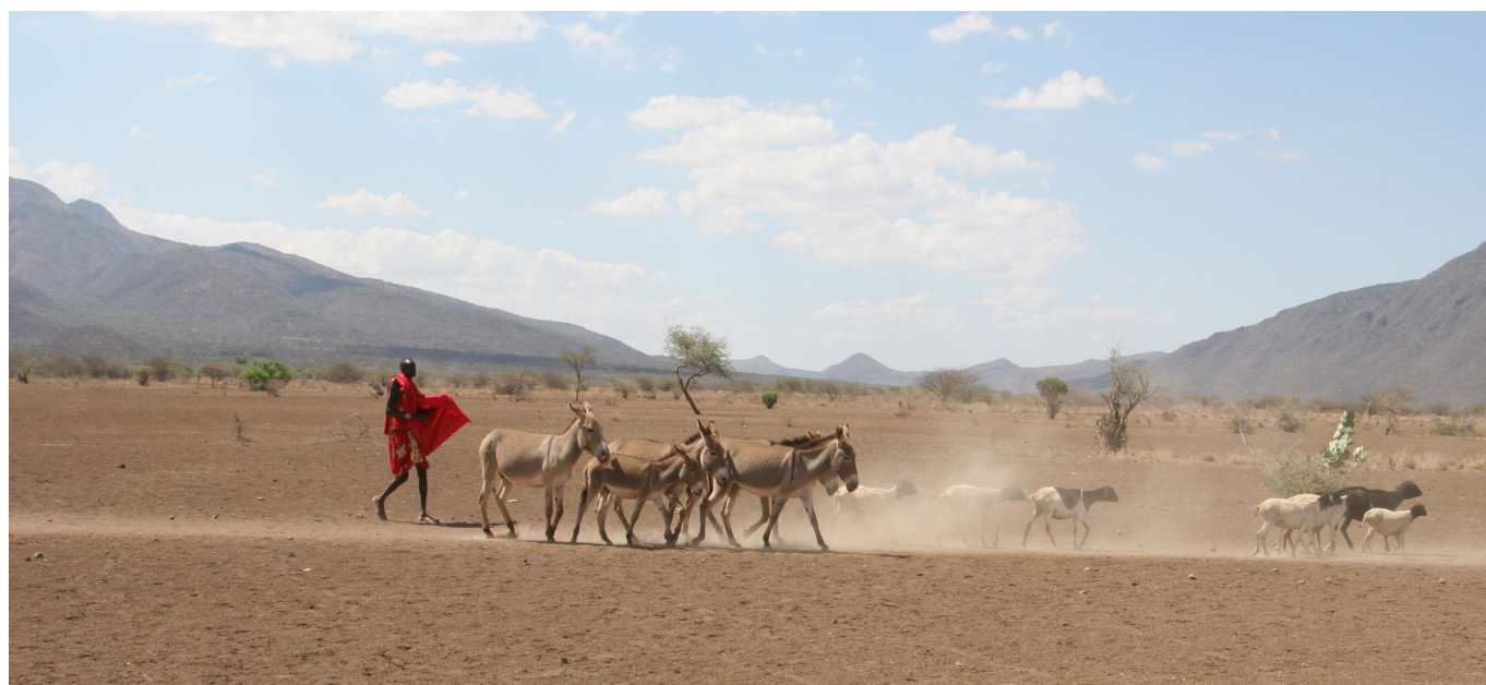
A livestock farmer brings his animals to a drying river in the Maasai Mara, Kenya

Our good practice principles are intended to encourage critical reflection and help project developers draw out relevant lessons of interest to a broader audience of African stakeholders.