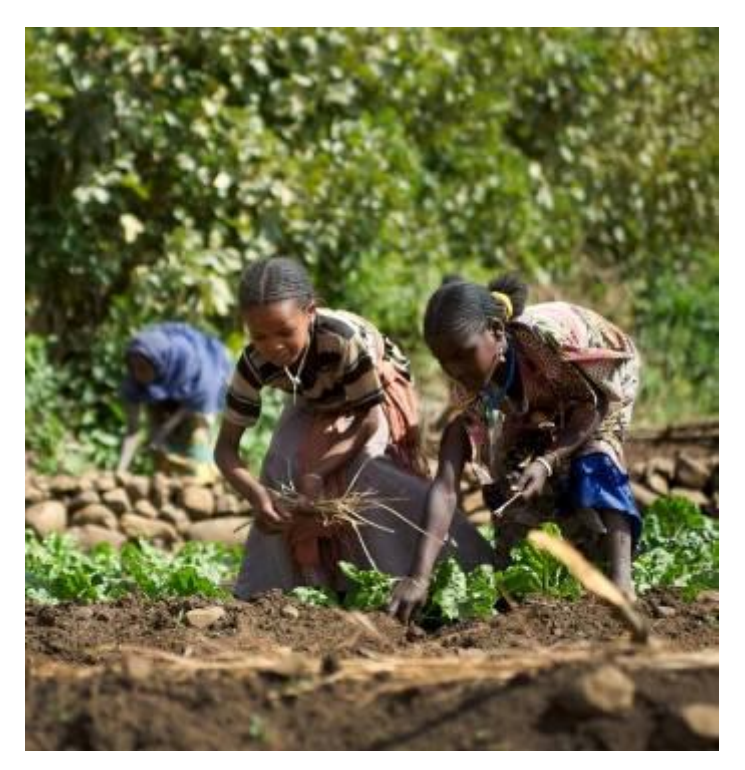
Girls supported by DRMFSS and ACCRA's work in Gemechis woreda. Ethiopia

This document is an output from a project funded by the UK Department for International Development (DFID) for the benefit of developing countries. However, the views expressed and information contained in it are not necessarily those of or endorsed by DFID or the members of the Climate and Development Knowledge Network, which can accept no responsibility or liability for such views, completeness or accuracy of the information or for any reliance placed on them.