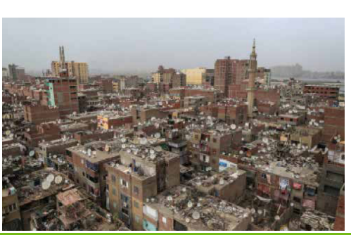
Fig. 1: Cairo suburb