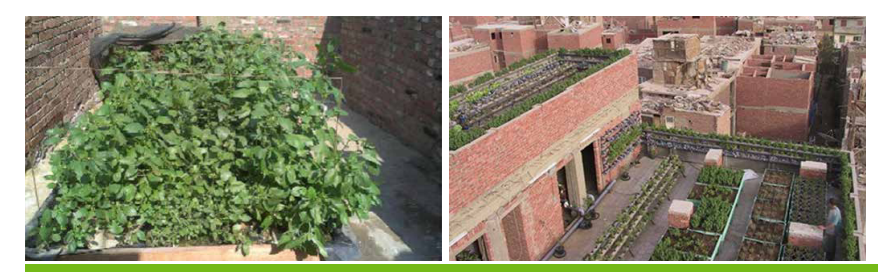
Fig. 4 (l): Soil based cropping on a rooftop Fig. 5 (r): Rooftop farming in Cairo, applying different cultivation techniques

The crops grown were gargeer ( Eruca sativa , ' Rucola ', Fig. 3), mint (Mentha spicata), molokheya (Corchorus sp.), onion, cherry tomatoes, strawberries and flowers. During the cultivation period the project was technically supported and monitored, but not intensively enough.