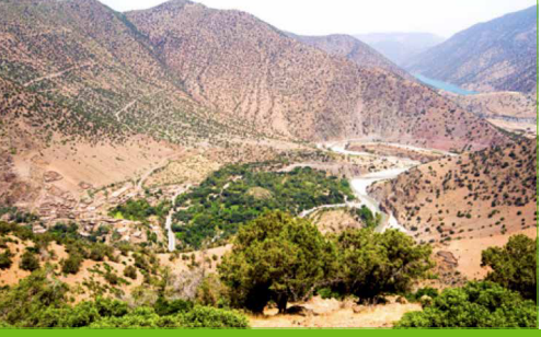
Fig. 1: Soil erosion is triggered by climate change impacts, endangering vegetation and fields in the valleys