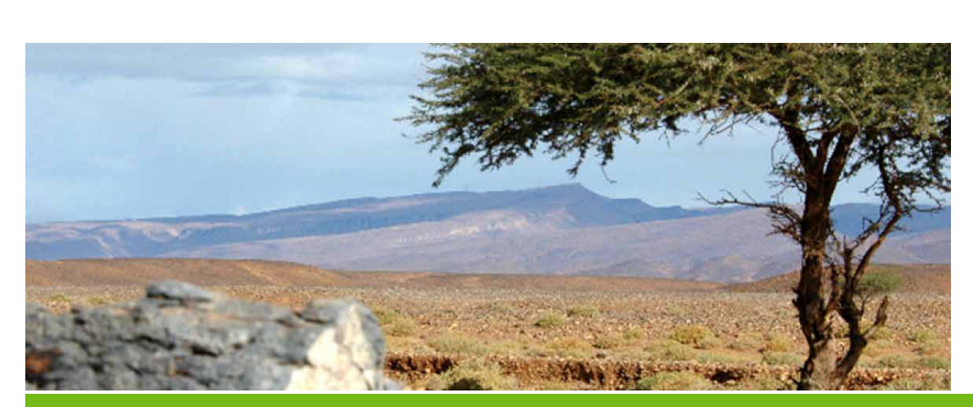
Fig. 3: Argan tree in Souss-Massa region

Sustainability standards were developed for local ecotourism in the Souss-Massa pilot region, particularly for protected areas as well as the argan forest and its products (Fig. 3). The basic groundwork for certification was created among Moroccan ecotourism providers.