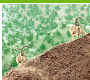
Fig. 2: The protection of wild mammals pose many problems in MENA countries

for Waters, Forests and Combating Desertification. The project shall last through June 2016. To consolidate the previous results of the ACCN project in the field of climate change adaptation, biodiversity and ecosystem services, a follow-up GIZ programme is planned on behalf of BMZ entitled 'Environmental and Climate Governance' (January 2016–December 2018).