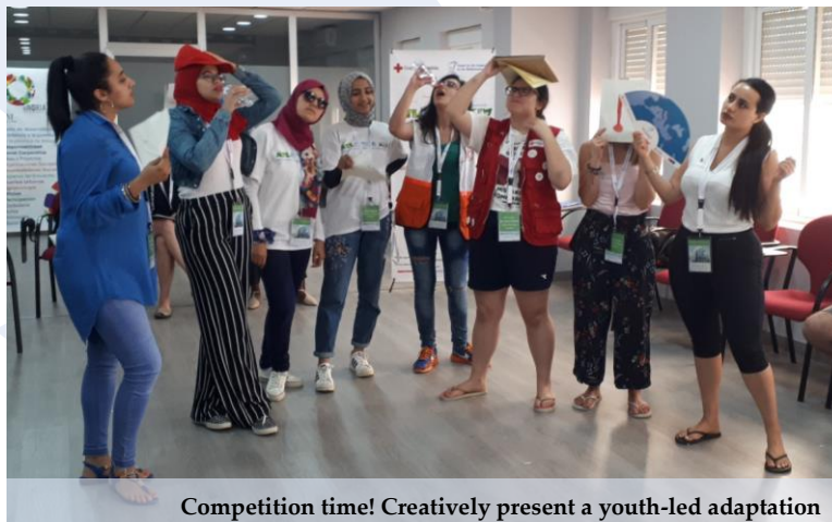
Competition time! Creatively present a youth-led adaptation