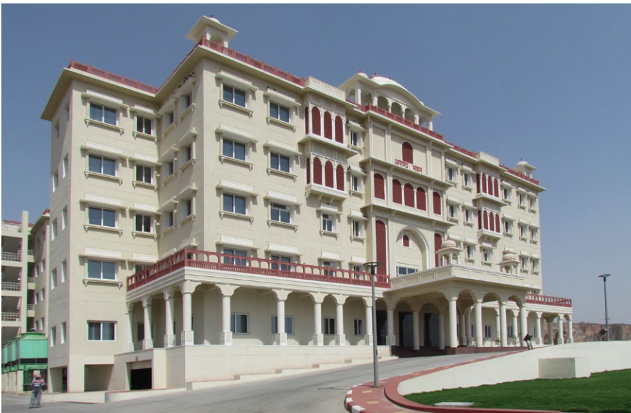
The building constructed for the Government of Rajasthan Forest Department in Jaipur can serve as a model. Its energy consumption is less than half that of the 'five-star' label developed by the Indian Bureau of Energy Efficiency.

The SDC also intends to make use of its presence in the GABC and IEA to advocate for the eco-friendly cement 'LC3' – which is better for the environment in almost every respect – a joint design by the Swiss Federal Institute of Technology Lausanne (EPFL) together with Indian and Cuban universities. "If we can convince the private sector of the benefits of using LC3, we can save 400 million tonnes of CO 2 , which is eight times the amount of emissions Switzerland produces every year," calculates Macchi. ■