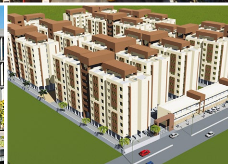
Architectural projects supported or awarded by the BEEP project are flourishing all over India, such as the latest hospital (top) to open in Pune, a city located 150km east of Mumbai.

The SDC has become a major actor in energy-efficient construction in India over the past ten years. It has been working alongside the authorities and hundreds of architects, industrialists and property developers to help construct several innovative buildings and create new markets. The SDC-funded project is also developing the country's first regulatory framework for the construction of residential buildings.