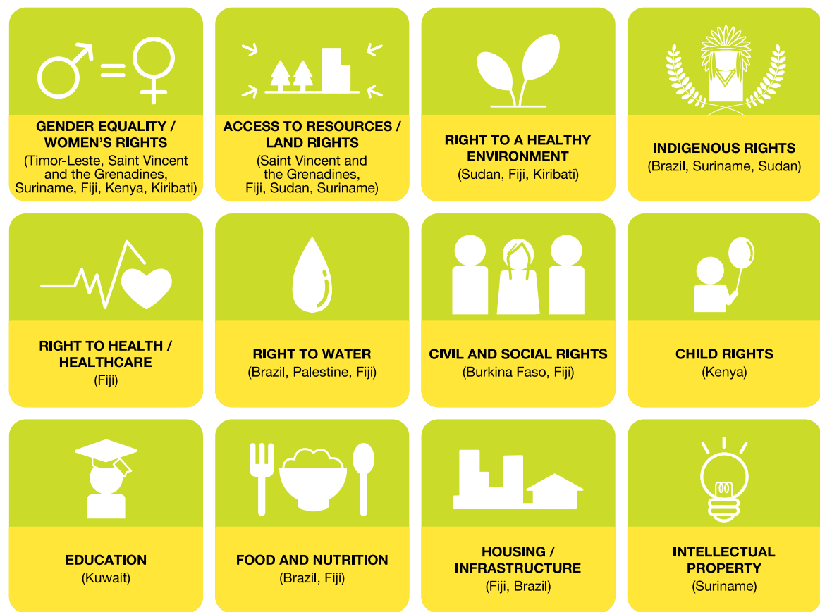
Figure 1. Nature of rights explicitly referenced in the reviewed NAPs

The NAPs of Fiji and Brazil have shown the greatest number of hits on the keywords “right” or “rights”, with 49 and 38 hits, respectively. However, only 36 hits in Fiji and 34 hits in Brazil were valid hits in that they refer to human rights either explicitly or implicitly. Some limited references to “right” or “rights” are found in the NAPs of Suriname, Saint Vincent and the Grenadines, Timor-Leste, and Sudan.