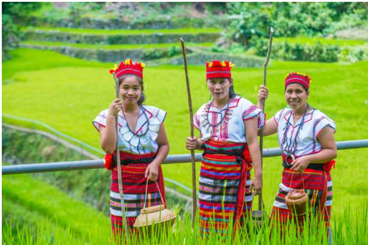
Women from the Ifugao minority group near rice terraces in Banaue, Philippines

Systematically applying a human rights-based approach and directly referencing human rights obligations will ensure that “the most vulnerable groups and communities” are the focus of adaptation planning and implementation, an important goal of NAPs. This study found that there are a variety of ways that human rights are both directly and indirectly referenced throughout the submitted NAPs. However, in all but one plan, they are not systematically referenced in NAPs. While referenced, human rights are not generally used to guide any part of the NAP process. As such, the NAPs leave much to be desired in making human rights principles both a guide in planning and implementation, as well as in defining desirable outcomes that represent the entitlements of vulnerable groups and communities. Despite repeated assertions, especially by the UN Special Rapporteurs on human rights and the environment and other scholars, that climate change is a human rights issue (Knox, 2016; Rajamani, 2018; Limon, 2018; Knox and Boyd, 2018; Atapattu,