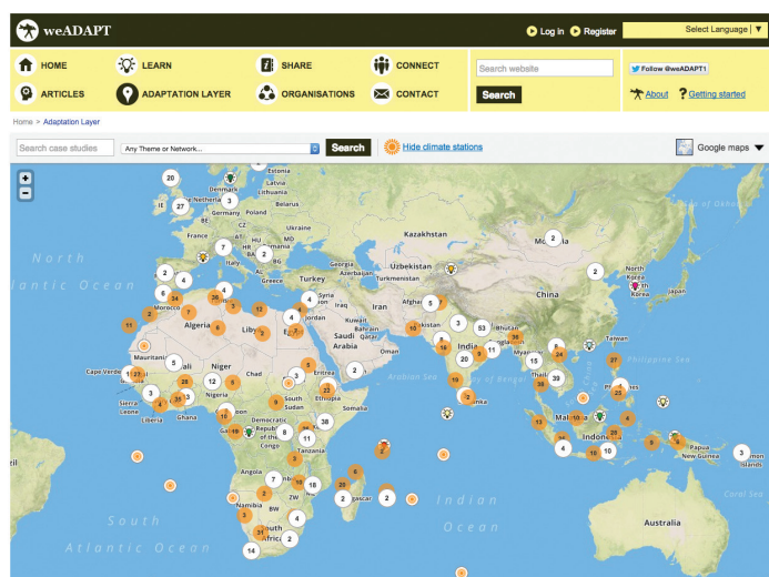
The Adaptation Layer with climate station data from CIP 3

Early in the development of weADAPT, users informed us of their desire to more quickly and engagingly communicate their work to different audiences, increasing the chance of influencing policy and other decision-making processes. This inspired us, through a project with Google.org, to create the Google Earth Adaptation Layer (see weadapt.org/adaptation-layer ), a feature which allows the presentation of place-based case studies in a visually compelling way. This is now very easy to achieve (see next point) and enables the sharing of adaptation “stories” (see weadapt.org/knowledge-base/guidance/adaptation-stories ) and lessons learned in a concise and spatially contextualized way.