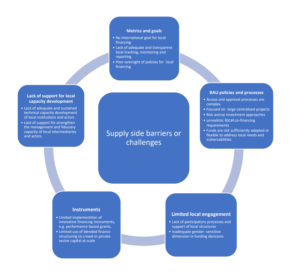
Figure 2: Diagrammatic representation of supply side barriers or challenges

It is therefore important to recognise that to successfully address the barriers or challenges that inhibit finance towards the local level, the proposed recommendations outlined in the previous section, must be carefully considered from both the supply side (providers of finance and their intermediaries) and from the demand side (recipients of finance and related intermediaries and project developers).