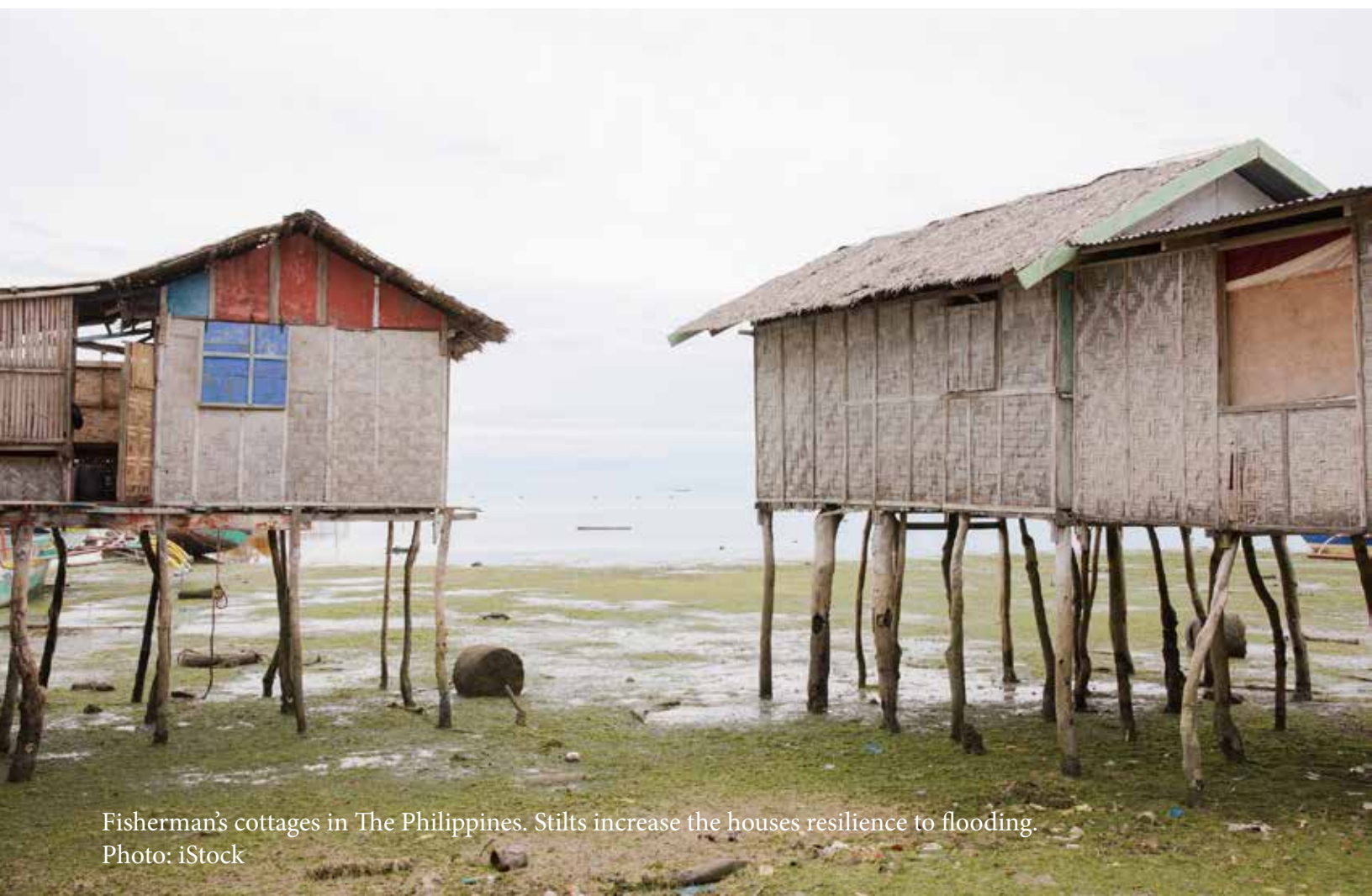
Fisherman's cottages in The Philippines. Stilts increase the houses resilience to flooding.

An average of nine typhoons hit the Philippines every year, affecting millions of people. Their impacts have been historically recorded, but datasets are not easily accessible as they are compiled and stored by a number of government agencies. Gathering, integrating and analyzing this data would allow researchers to generate insights to support decision-making during extreme weather events as well as long-term disaster risk reduction planning.