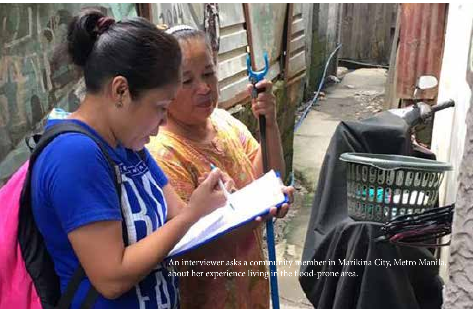
An interviewer asks a community member in Marikina City, Metro Manila, about her experience living in the flood-prone area.

Tropical cyclones frequently hit the Philippines with heavy impacts on infrastructure, agriculture and communities. A mechanism to assess damages and losses is crucial in informing decision-making and policy development. However, existing assessments only focus on infrastructure damages, neglecting the significance of other types of impacts on people, such as those related to physical and mental health, education and social capital. This research is an attempt to evaluate both economic and non-economic losses due to floods at the household level.