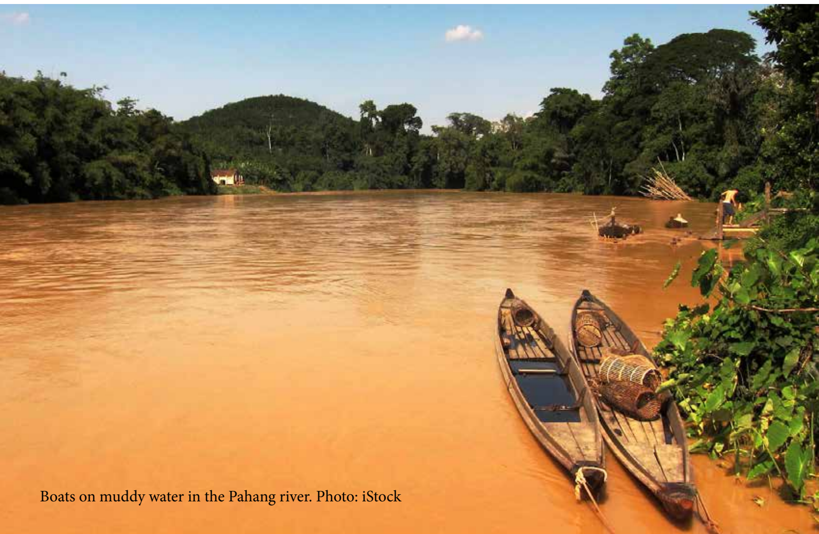
Boats on muddy water in the Pahang river.

In recent years the Pahang river basin has experienced devastating floods causing loss of lives and destroying agricultural fields and infrastructure. Recurrent floods have threatened the quality of the Pahang river water, which is used by over one and a half million people for drinking and domestic use. The local communities do not participate in water management programs. However, more engagement from all stakeholders could support the long-term success of water management programs, and ensure that the Pahang river continues to provide clean water to the local communities.