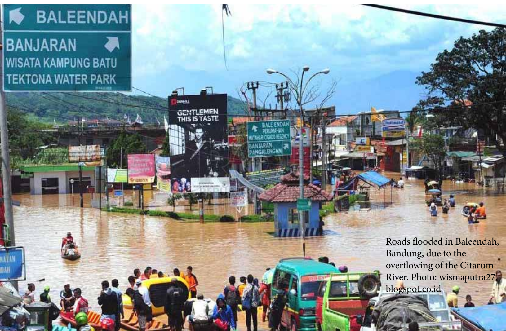
Roads flooded in Baleendah, Bandung, due to the overflowing of the Citarum River.

Rapid urbanization and climate-related disasters constitute challenges for peri-urban areas in Indonesia. Integrating disaster risk reduction and climate change adaptation into development planning is essential to prevent and minimize the impacts of these challenges. This study focused on the development plans of South Bandung, part of Metropolitan Bandung, the third biggest metropolitan area in Indonesia.