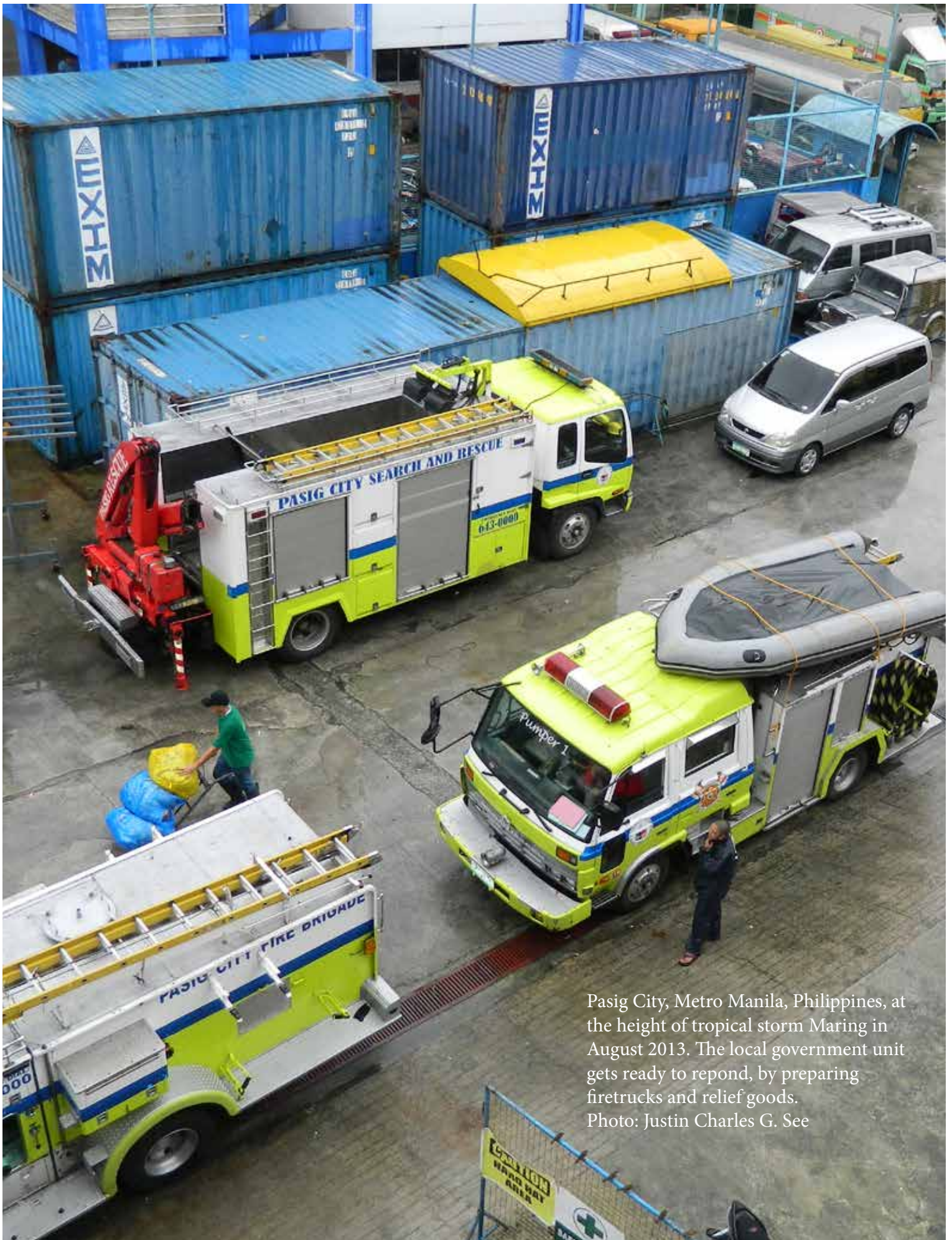
Pasig City, Metro Manila, Philippines, at the height of tropical storm Maring in August 2013. The local government unit gets ready to repond, by preparing firetrucks and relief goods.