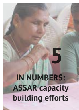
IN NUMBERS: ASSAR capacity building efforts