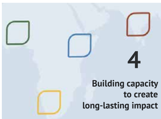
Building capacity to create long-lasting impact