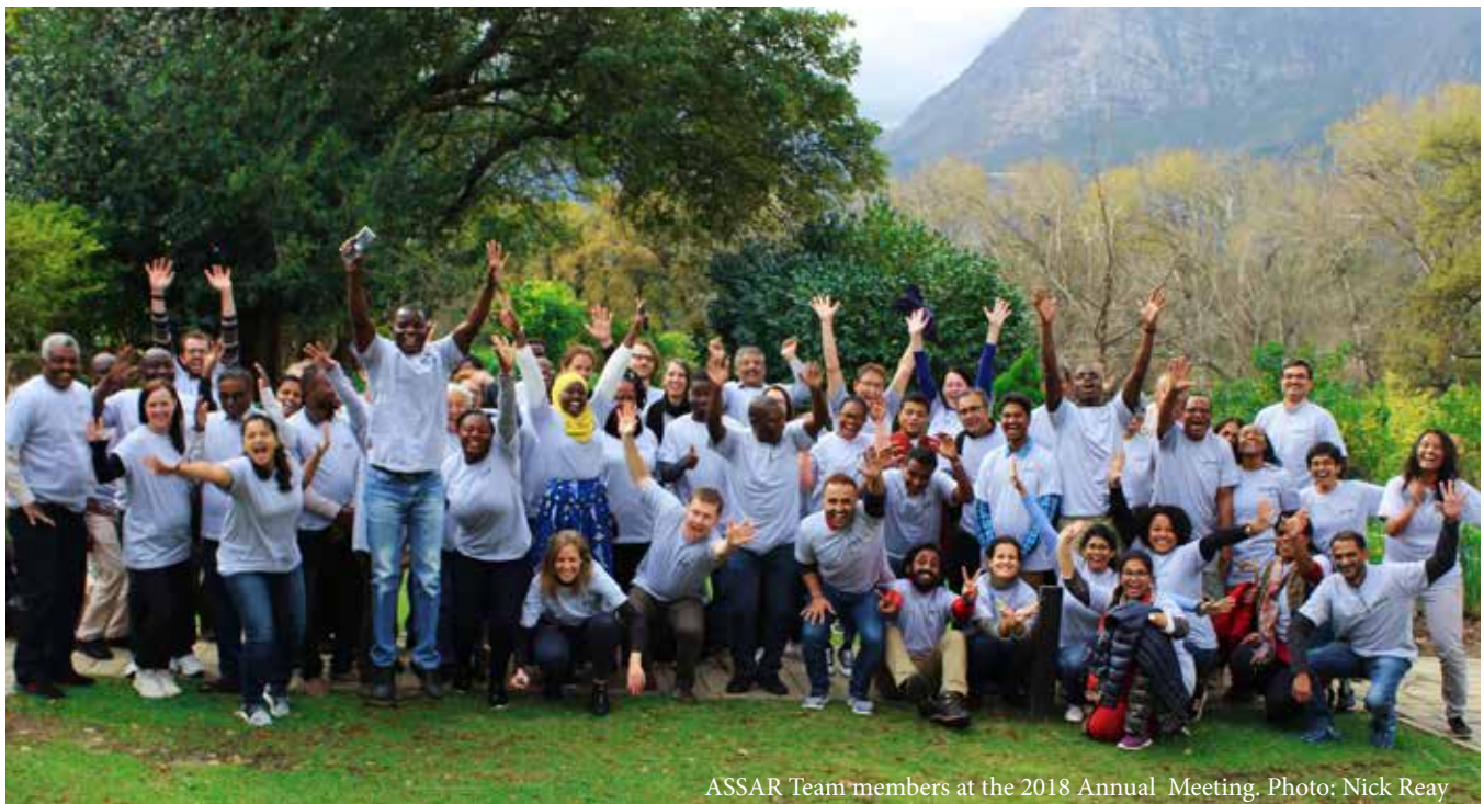
ASSAR Team members at the 2018 Annual Meeting.