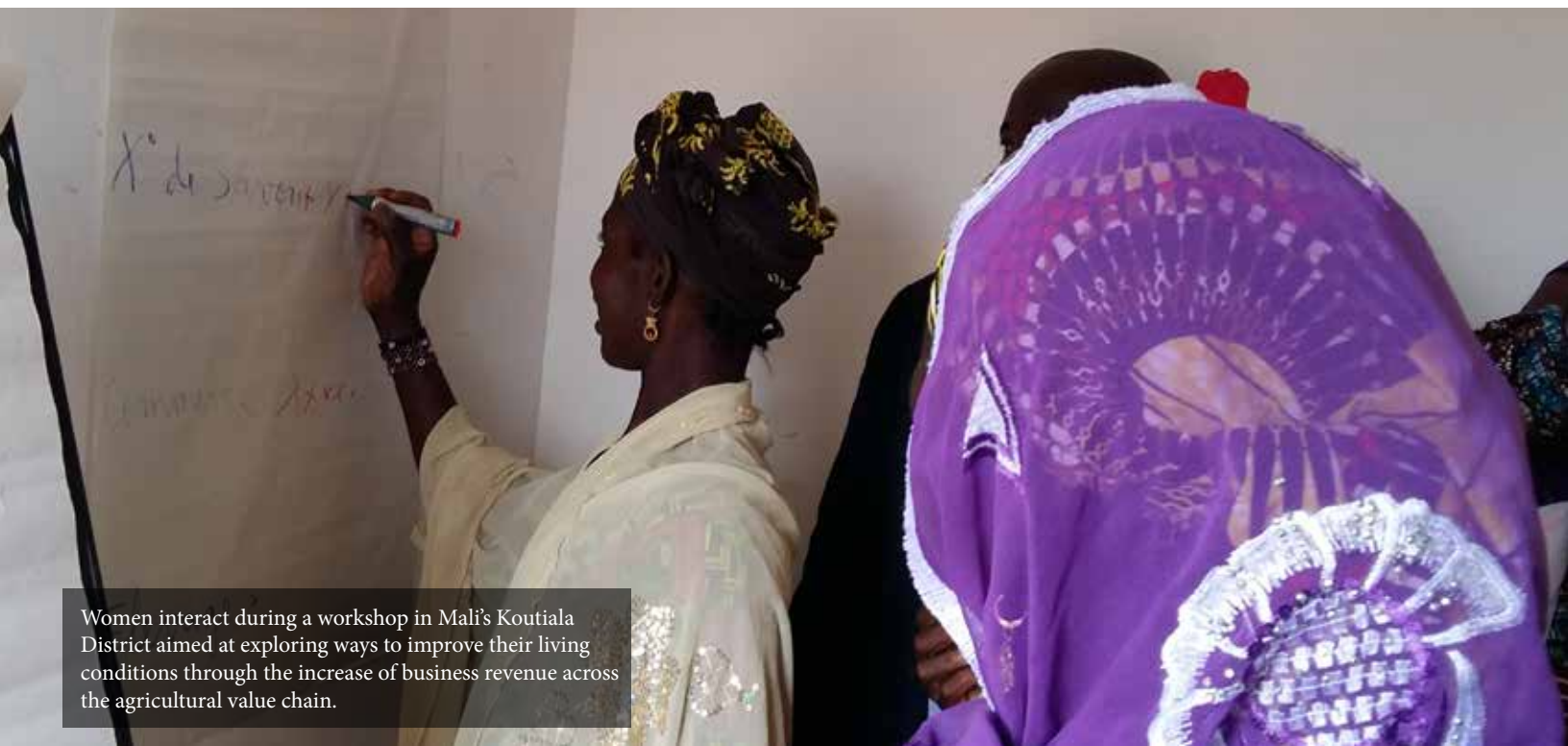
Women interact during a workshop in Mali's Koutiala District aimed at exploring ways to improve their living conditions through the increase of business revenue across the agricultural value chain.

Adapted from the article Building the adaptive capacity of women in Mali's Koutiala District , published on the ASSAR website.