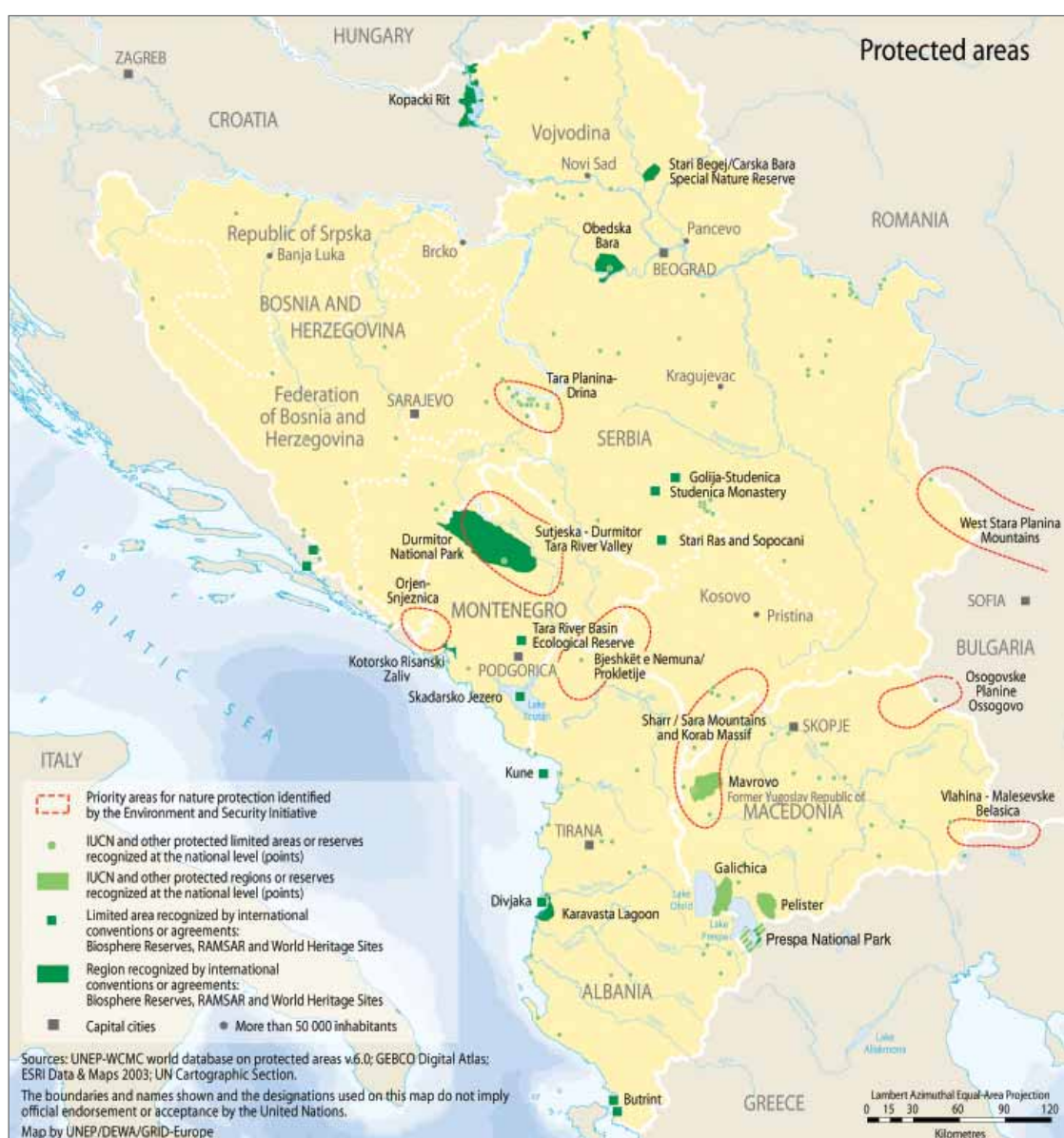
Figure 3. Protected areas in the Balkans

37. Only about 6% of the Balkans is currently under legal protection, ranging from 0.8% in Bosnia and Herzegovina to 9.1% in Albania and Croatia. The largest protected area in the Balkans, the Stara Planina Nature Park, covers an area of 142,220 ha in Serbia and Bulgaria (UNEP/GRID, 2007a). Other protected areas in the region include various national parks: Sutjeska (17,350 ha) in Bosnia and Herzegovina; Mavrovo (73,088 ha), Galicica (22,750 ha) and Pelister (12,500 ha) in the Former Yugoslav Republic of Macedonia; Durmitor (32,000 ha) in Montenegro; and Djerdap (63,608 ha), Fruska Gora (25,393 ha), the Sar Planina/Sharr Mountains (39,000 ha), Tara (19,175 ha) and Kopaonik (11,810 ha) in Serbia.