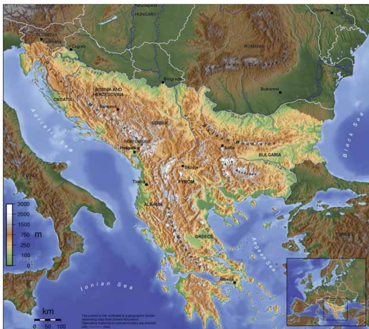
Figure 2. Mountains in the Dinaric Arc and Balkans region

28. In the Resolution on the Sustainable Development of the Dinaric Arc Region, adopted in Brdo (Slovenia), on 9 March 2011, Ministers declared to strive to develop a legal framework of cooperation (with the assistance of UNEP) to jointly protect, maintain and sustainably manage the natural resources of the region, including ensuring ecological integrity and territorial cohesion. 8