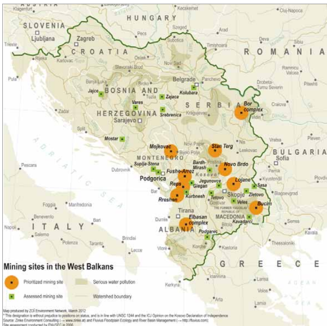
Figure 5. Mining sites in the Western Balkans