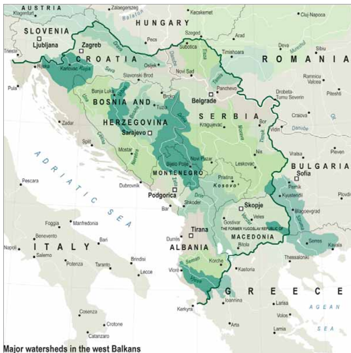
Figure 4. Watersheds in the Western Balkans

38. Water: The Balkans are rich in wetlands with 43 Ramsar sites in the region. Unfortunately though, the loss of wetlands has not been well quantified for the region, except for the Danube floodplains. In Bulgaria, the exploitation of riverbed materials in the Maritsa, Tundja and other rivers has increased significantly over the past decade, particularly as a result of poor law enforcement, resulting in the destruction of riparian habitats, extinction of species, subsidence of groundwater, increased risk of flooding, and the destruction of buildings and roads.