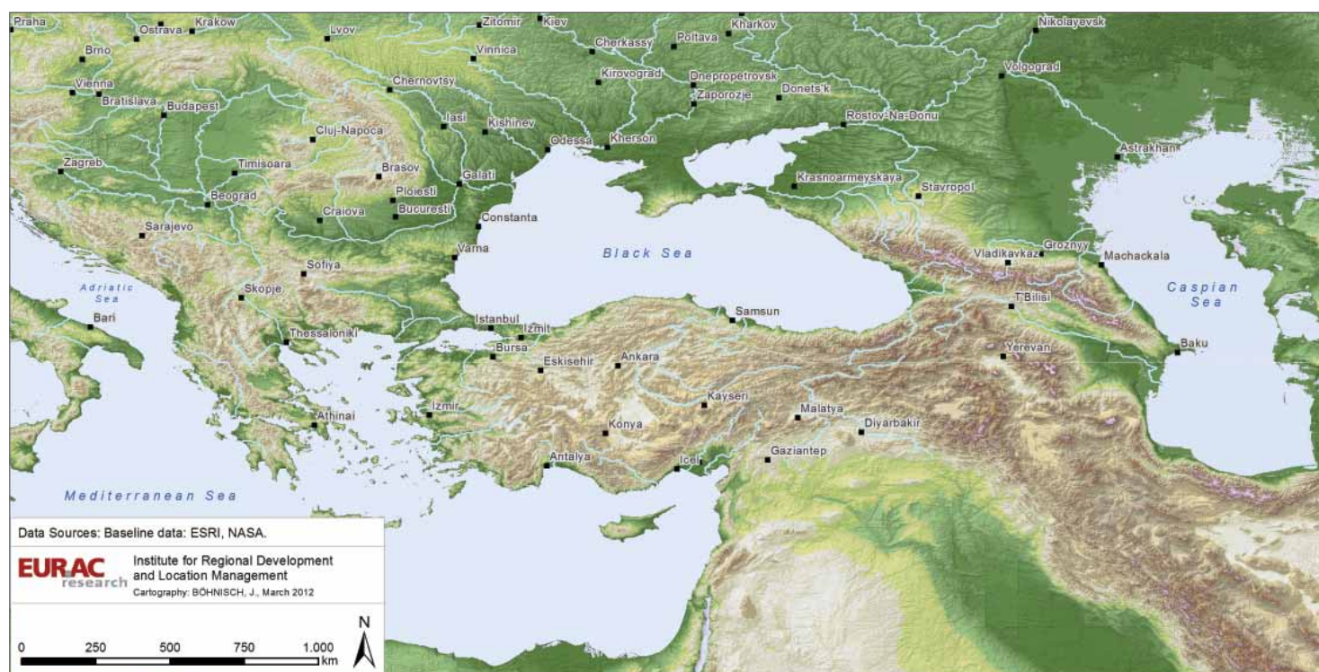
Figure 1. Map of the Mountains in Central, Eastern and South Eastern Europe

Both the challenges and opportunities for substantial improvement in all aspects of transboundary and national sustainable mountain development are enormous, with success stories leading to increased regional collaboration and stability. As the European and global experience show, the challenges of sustainable mountain development cannot be effectively solved without intergovernmental cooperation. As an example, in the Carpathian region, international cooperation within the Framework Convention on the Protection and Sustainable Development of the Carpathians provides a solid base for measures to balance environmental protection and sustainable regional development, and to improve the living conditions of the local population.