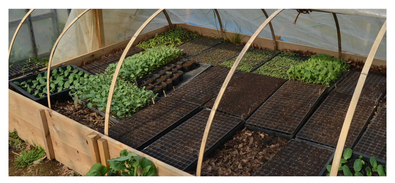
Example of a sustainable agriculture practice highlighted on the study tour