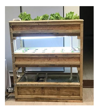
Experimentation of various light sources in a vertical hydroponic system built by Saint Lucian study tour participant

The South-South transfer of knowledge promotes responsible farming and reduces the dependence on commercial fertilisers that result in the emission of greenhouse gases.