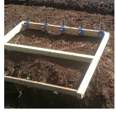
Sowing device replicated by a farmer in Dominica, following the Japan-Caribbean study tour