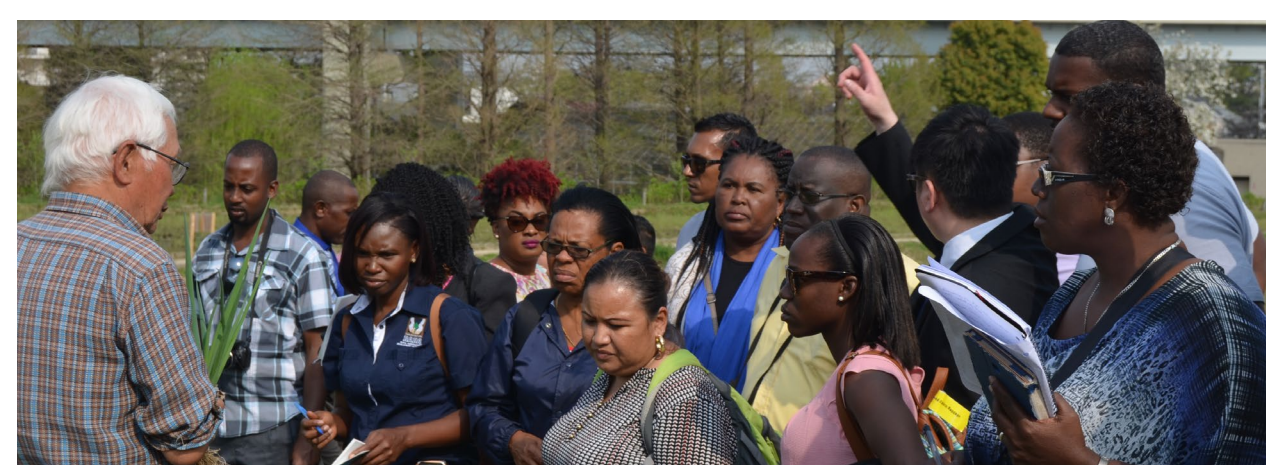
Study tour participants listen to a representative from the Japan Organic Agriculture Association (JOAA) Learning from Japan

a few of the current phenomena impacting crop yield and, by extension, the region's food security. Various Caribbean governments and developmental organisations have begun implementing projects and strategies to mitigate the impacts of climate change. As such, the United Nations Development Programme's Japan-Caribbean Climate Change Partnership (UNDP J-CCCP), coordinated a study tour focusing on transferring knowledge and applicable technologies from Japan to the Caribbean in the field of agriculture. This case study highlights the key points, takeaways and insights as it relates to the North-South and South-South transfer of technology required to develop a more resilient agricultural sector in the Caribbean.