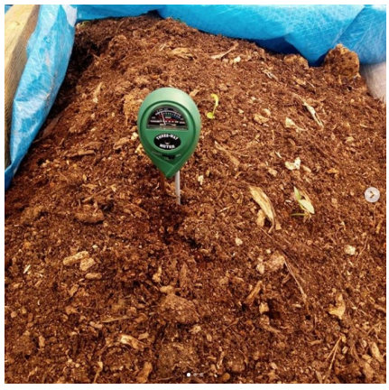
Soil and pH monitor being used by a Dominican farmer to test optimal conditions for planting