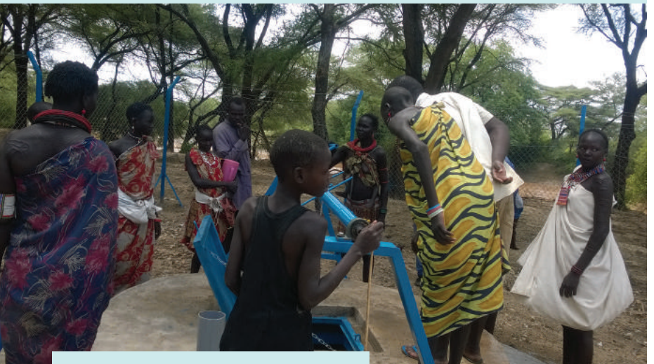
Villagers in Lotiyan, Kapoeta, peer inside a new shallow well with a holding capacity of 7600 m<sup>3</sup>.