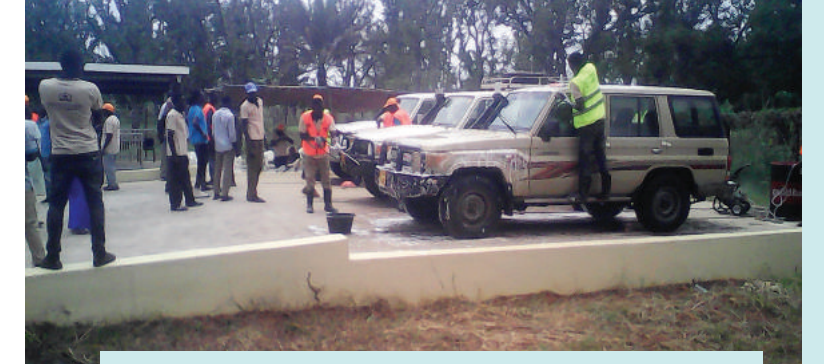
W4EE supported the establishment of youth-run commercial car washing bay in Torit enhancing, the relationship between young people and the municipality while reducing the release of pollutants into the Kenneti River.

See W4EE Success Stories: <u>Safe Water</u> and <u>Sanitation & Hygiene</u> for more details.