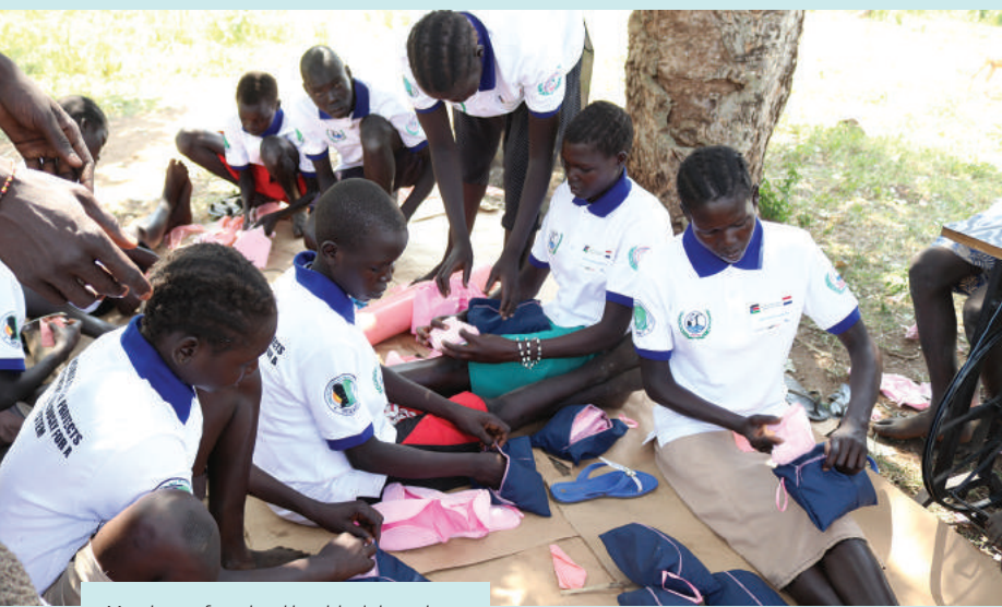
Members of a school health club package sanitary pads they have produced with the help of material and training.

Award of open-defecation-free (ODF) certificate of appreciation in Habironge VIIaae in the Imatona Mountains.