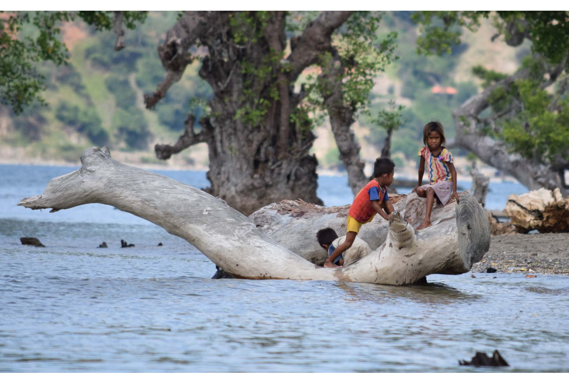
Children play in the mangroves on the northern coast of Timor-Leste in April 2015.