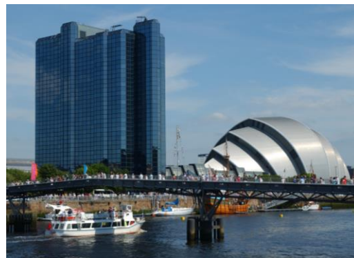
A view of Glasgow city

detailed economic and financial analysis and business cases for a selection of portfolio of actions which, if delivered in combination have the potential to catalyse a transformational approach to climate change adaptation. Read the portfolio blueprint here. The Strategy and Action Plan was heavily informed by the Clyde Re:Built project which brought together specialists in innovation, economics and finance, governance and culture.