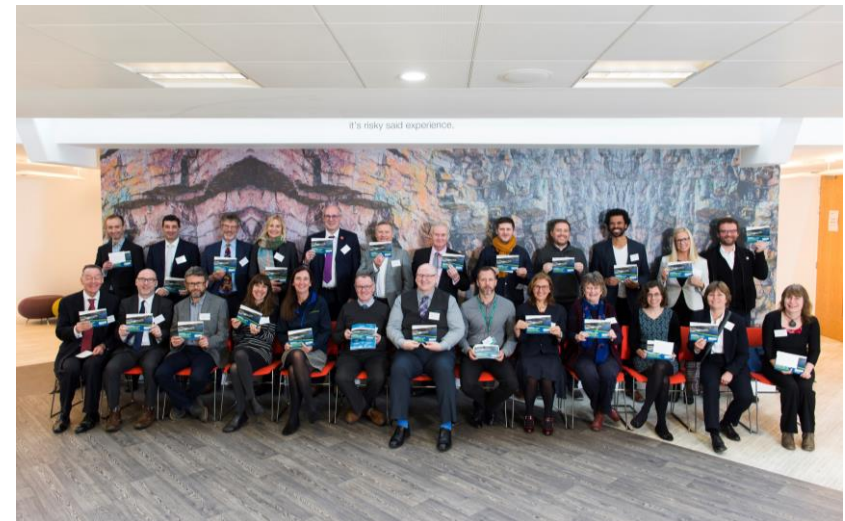
Participants at the Climate Ready Clyde Conference