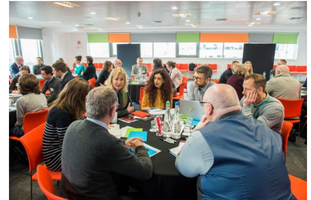
Participants at a CRC Conference