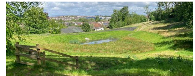
The North Basin of the Glasgow City Region

The TaIX project is funded under the EPA Research Programme 2014-2020. The EPA Research Programme is a Government of Ireland initiative funded by the Department of the Environment, Climate and Communications.