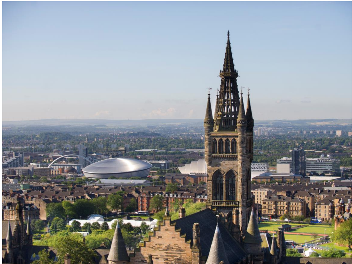
Aerial View of Glasgow City

Climate Ready Clyde is the leading initiative working to ensure Glasgow City Region is able to adapt to the challenges of our changing climate, and for everyone to benefit from this transformation. It is funded by 14 member organisations – including the eight local authorities and supported by the Scottish Government. This is a collaborative partnership and has been widely recognised for its ambition to drive a truly transformational approach to adapting to climate change. Climate Ready Clyde, together with its partners is creating the conditions for a regional transformation, building the collective evidence base and capacity, and has produced Glasgow City Region's first Adaptation Strategy and Action Plan to make it happen.