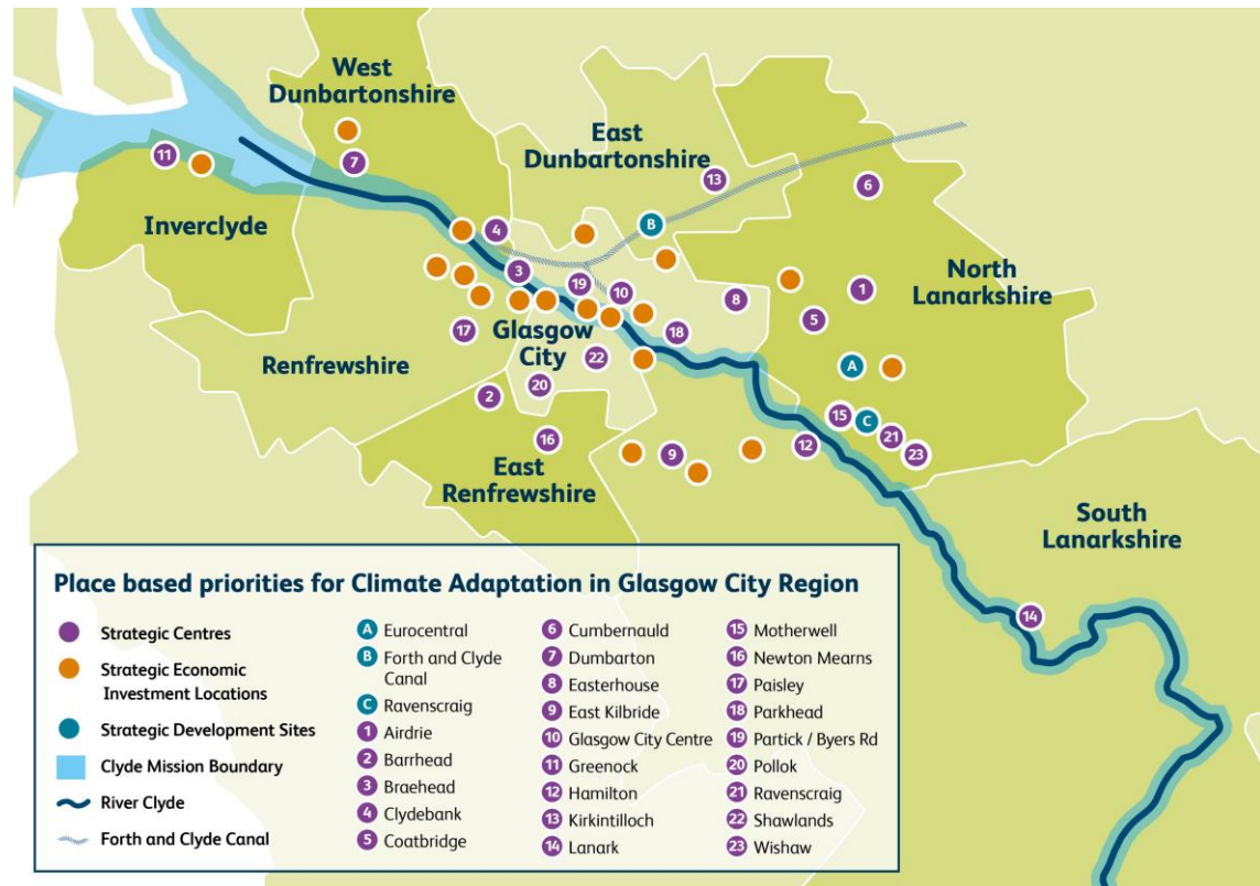
Place based priorities for climate adaptation in Glasgow City region

focused on system change and transformational adaptation, COACCH – Co-designing the Assessment Of Climate Change costs and OpenCLIM (Open Climate Impacts Modelling Framework).