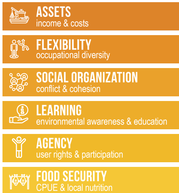
Figure 1. The fourteen assessed ecological and social pathways that contribute to climate change adaptation.