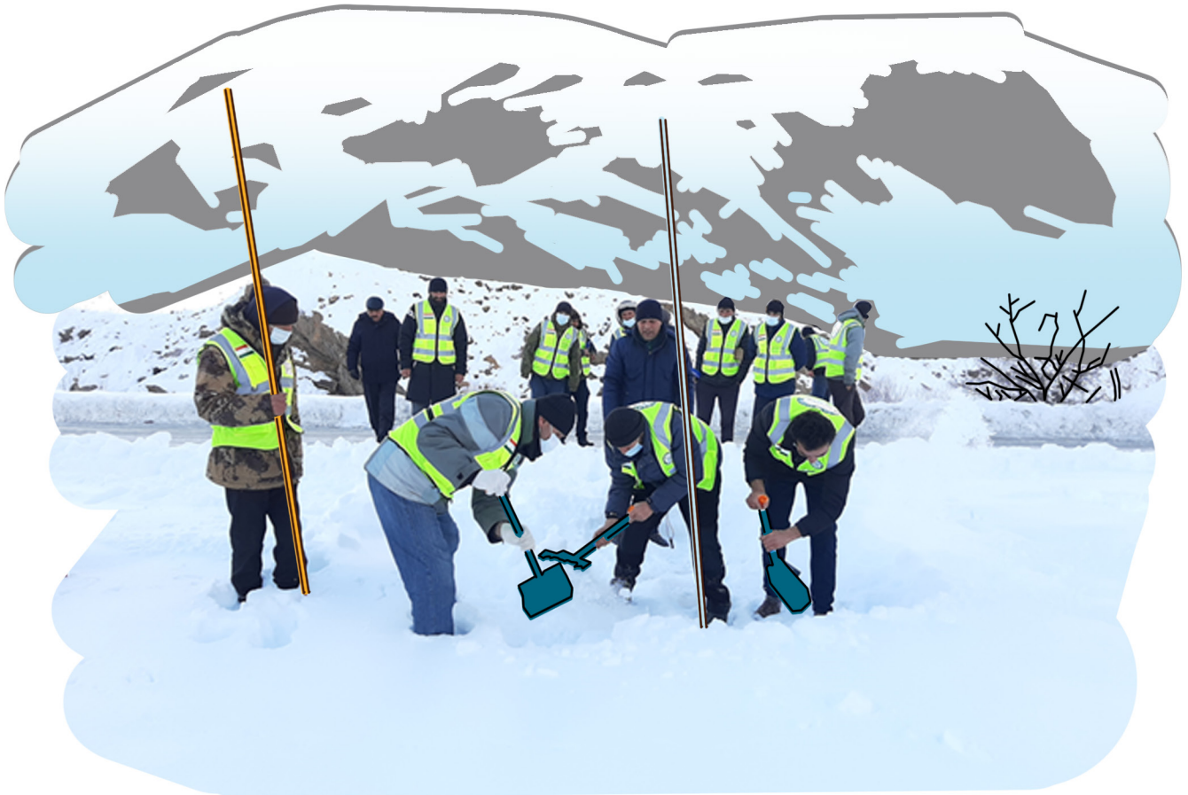
An exercise on high altitude Search and Rescue being conducted with the volunteers from the Avalanche Village Preparedness Team of Barchadev, Nishusp and Pish villages in Tajikistan.

Avalanches can be transboundary hazards. Large-scale ice avalanches can mobilise solid material in downstream areas and pose risks to lives, livelihoods, and infrastructure. Between 2010 and 2021, 919 avalanche events and 362 fatalities were recorded across Afghanistan, Pakistan and Tajikistan (Gurung et al. , 2023). Seasons with heavy avalanche activity generally extend across borders and the associated risks and negative consequences (e.g. for international tourism in the Himalaya, labour migration in the Hindu Kush) are of a transboundary nature (Acharya et al. , 2023).