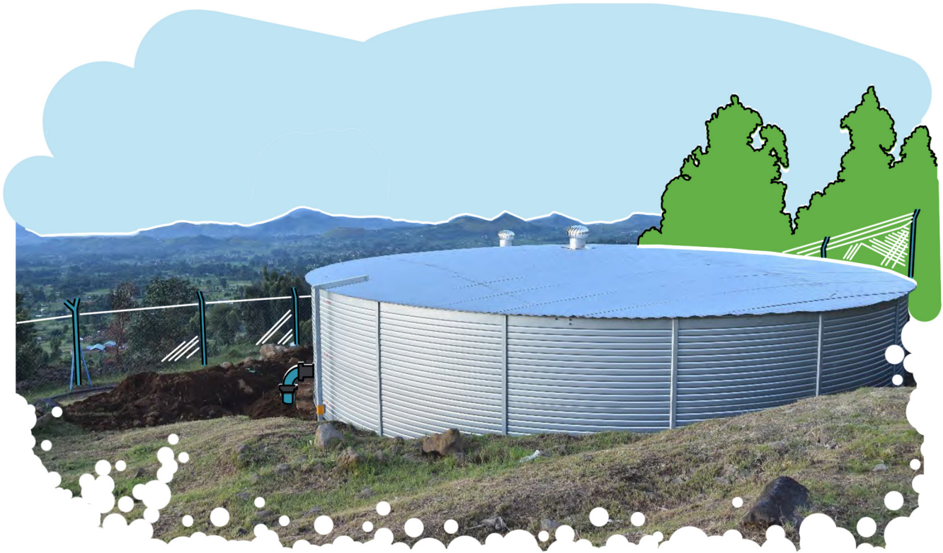
Buzeyi park reservoir that supplies Muramba subcounty.