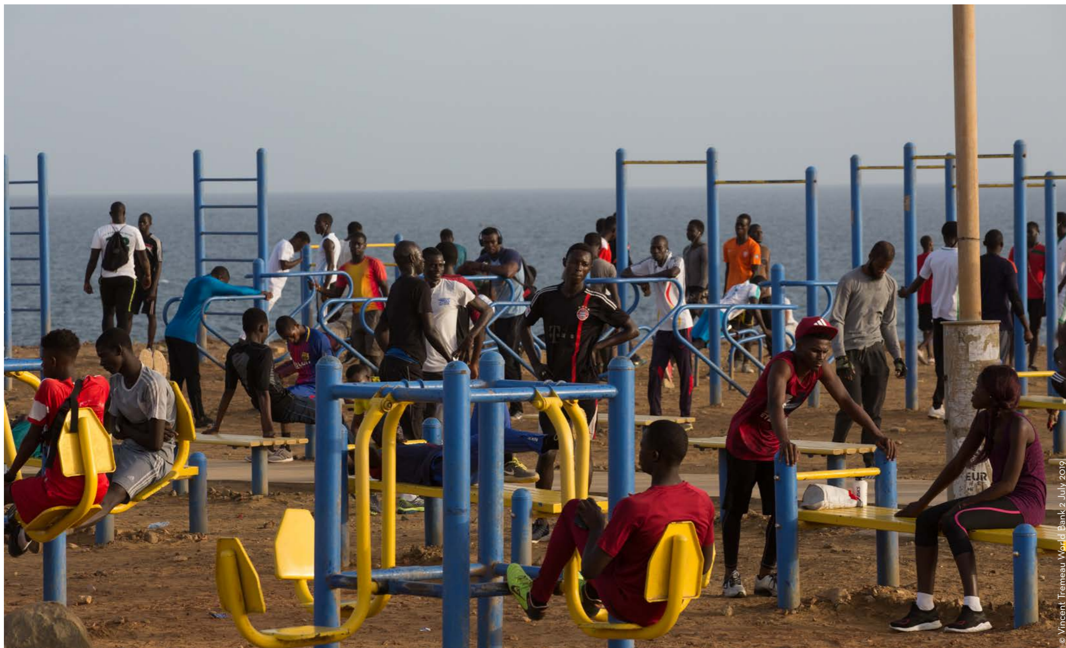
2 July 2019