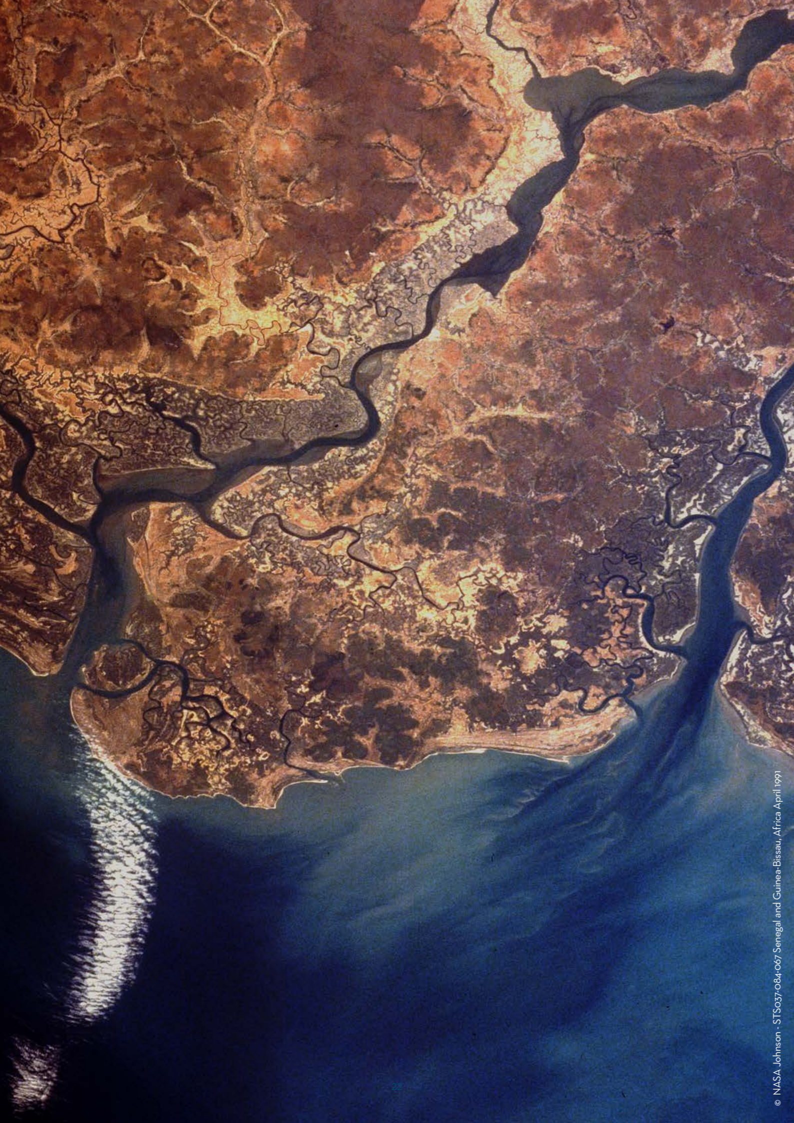
Senegal and Guinea-Bissau, Africa April 1991