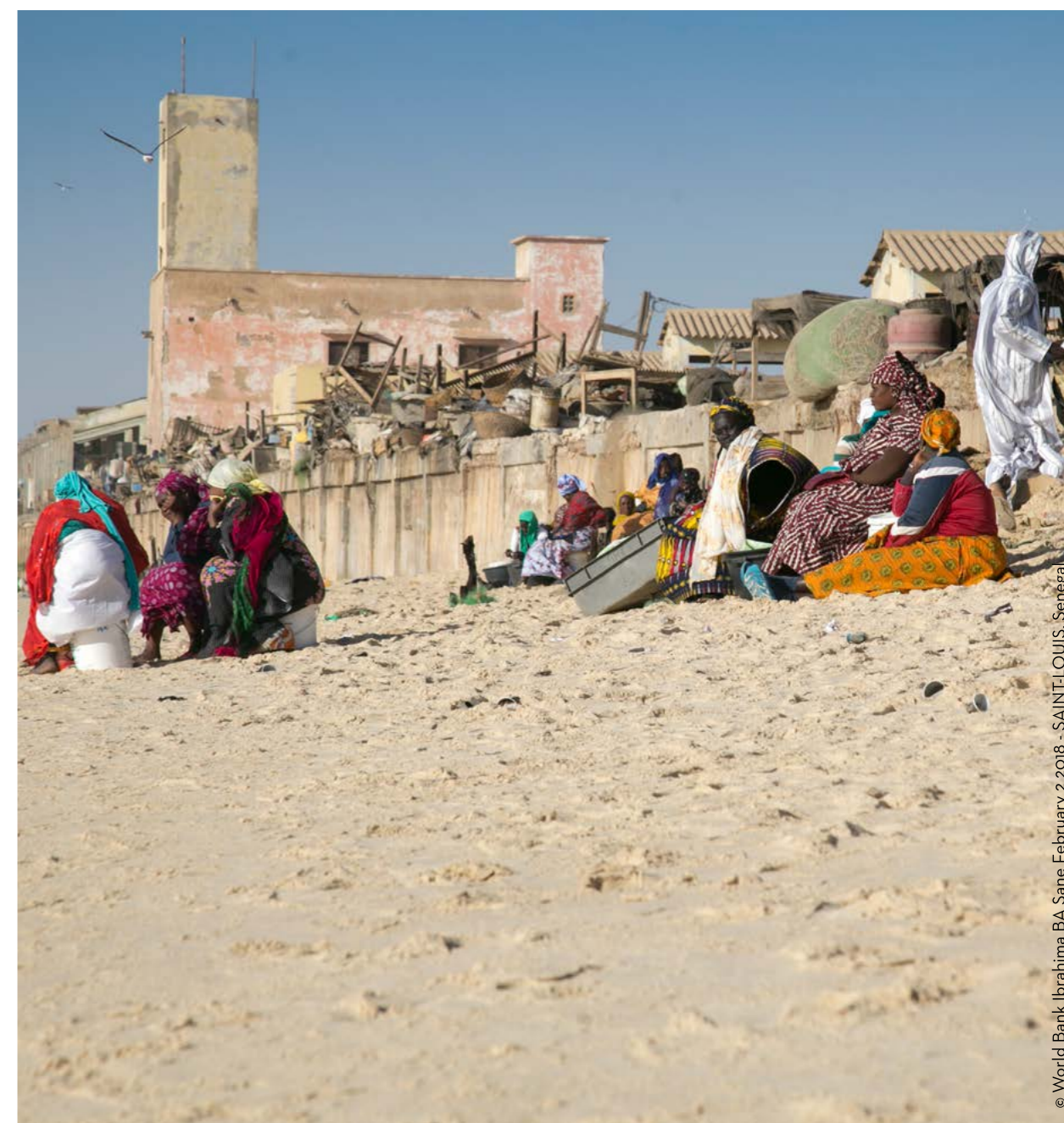
© World Bank Ibrahim BA Same February 2 2018 - SAINT-LOUIS, Senegal

Finally, in a long-term adaptation perspective, the aim is to align all legislation relating to coastal management with the challenges posed by climate change and develop strategic guidelines at regional and national levels to assist local action. These guidelines are crucial to favour an adaptation approach and governance methods that are more inclusive and innovative at local level. They should actively promote certain types of solutions that have not yet been fully explored, such as ecosystem-based adaptation and managed retreat. In that sense, regional guidelines would encourage States and municipalities to break free from the paradigm of hard protection often favoured despite its socio-economic cost and environmental impact. In this regard, the Multi-